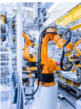
Automotive & Heavy Machinery